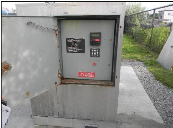
Current outdated Station Control Panel

This retrofit will improve customer service and help meet the needs of the City's business community of water haulers.