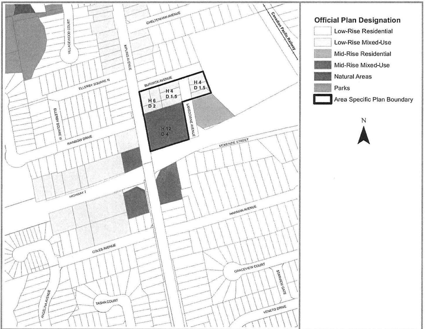
Map 12.15.A: Northeast Quadrant of Kipling Avenue and Highway 7 - Land Use, Density and Building Heights Plan